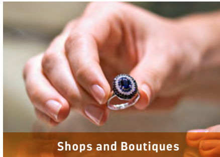
Shops and Boutiques